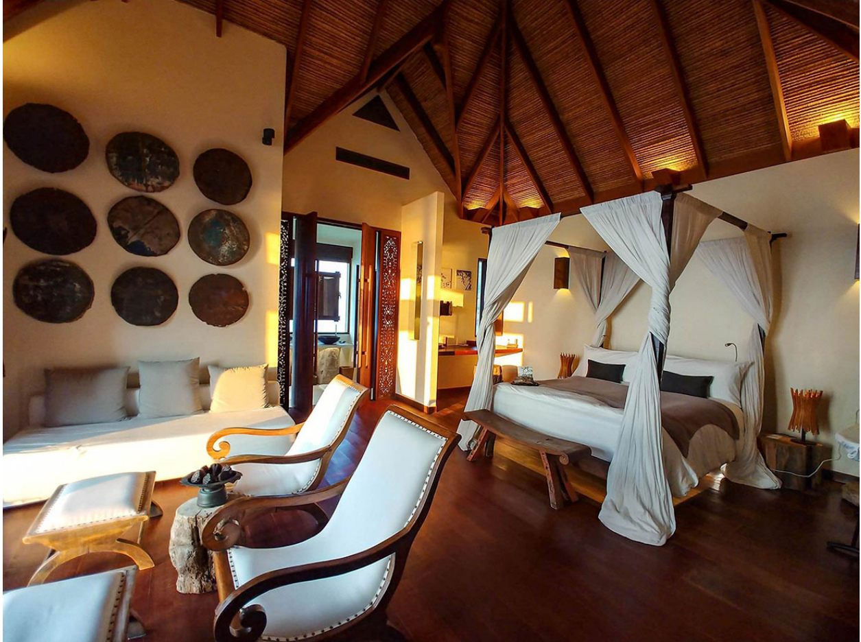
Royal Villa Interior.

As a private island experience, how does Song Saa Private Island mesh with trends for privacy in the post-Covid World?