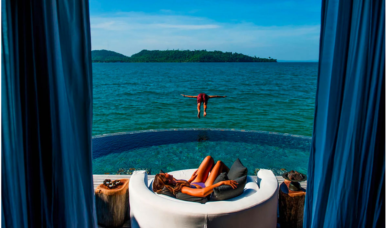
Royal Villa Exterior.

Wellbeing and wellness activities seem to be the theme of much post-Covid travel. What are some of the wellbeing features of Song Saa Private Island?