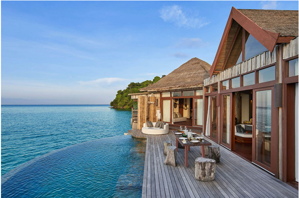
Villa exterior at Song Saa Private Island.

PADI divers, as well as dive orientation in our main pool and scuba review/refresher courses for anyone who's been a 'fish out of water' for too long. Whenever you come, you can expect to see a diverse abundance of corals and anemones as well as fish a plenty including scorpion, angel parrot, moray eels, seahorses, barracuda, Napoleon wrasse, trigger fish, puffer fish, rainbow runners, sting rays, octopus and horseshoe crabs, just to name a few.