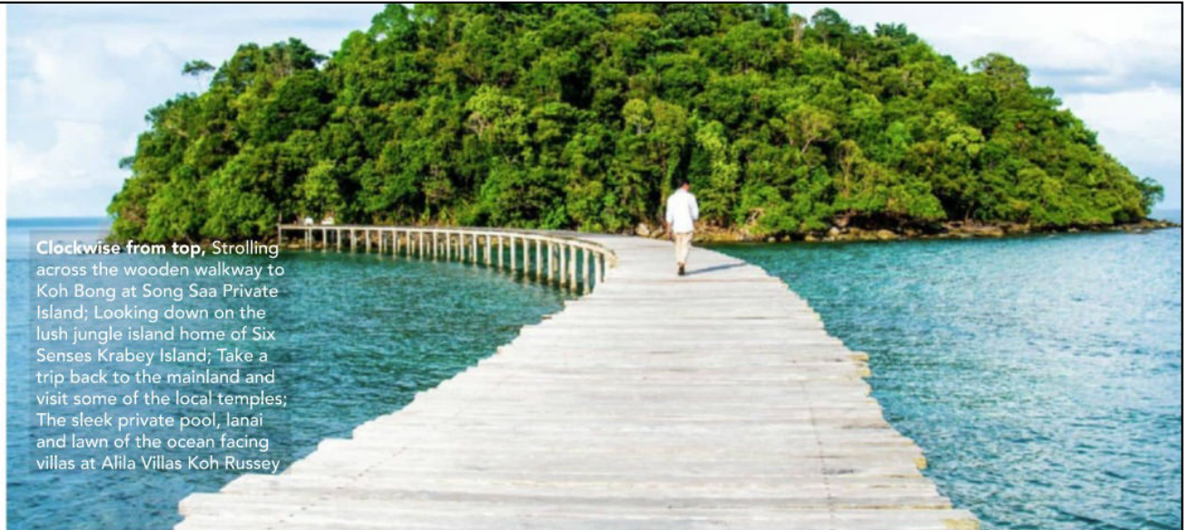
Clockwise from top, Strolling across the wooden walkway to Koh Bong at Song Saa Private Island; Looking down on the lush jungle island home of Six Senses Krabey Island; Take a trip back to the mainland and visit some of the local temples; The sleek private pool, lanai and lawn of the ocean facing villas at Alila Villas Koh Russey